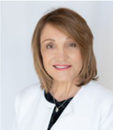
The Lifetime Community Achievement Award