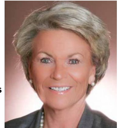
The Florence Lee Jones Humanitarian Award